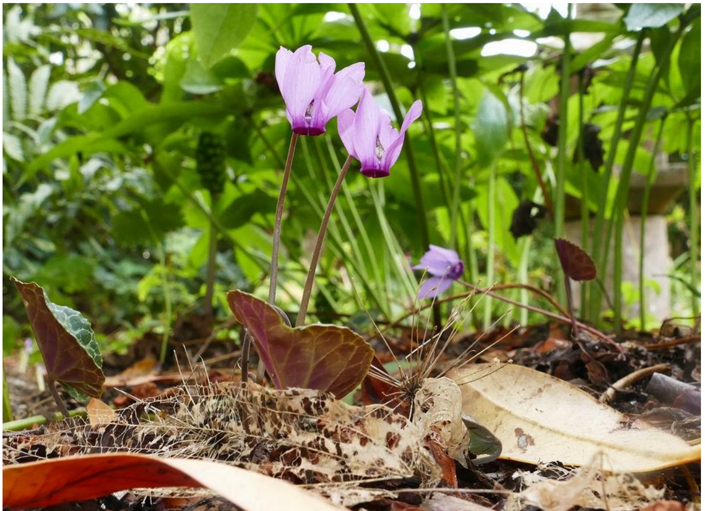
Once again while clearing away some of the old growths to make way for the emerging autumn flowering bulbs I found a Cyclamen purpurascens lurking in the shade of some Disporum foliage.