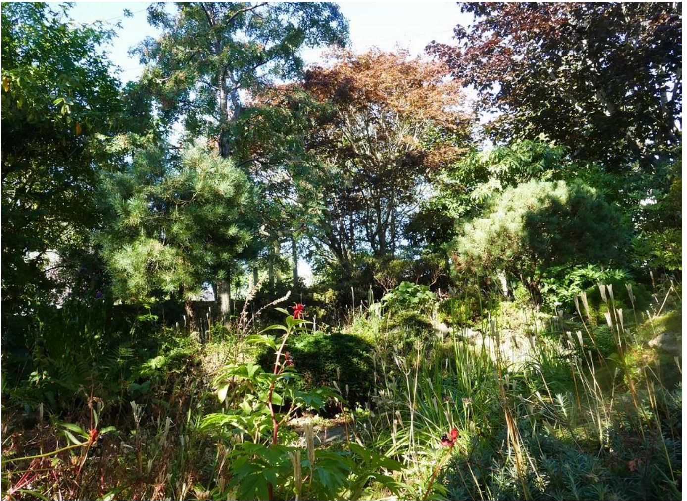
The patchy lighting effect of light and shade brings out the emerging autumn colours of the garden while above my head (below) the trees are set against a clear blue sky.