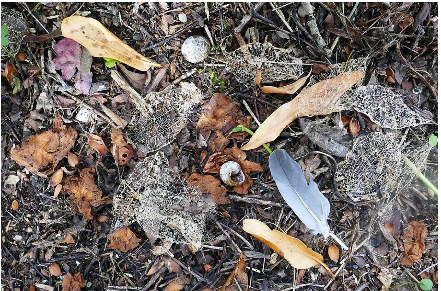
I am always attracted to the skeletal remains the Disporum leaves turn into – they do this quite quickly sometimes while they are still attached to the plant- I admired it here in a natural still life.