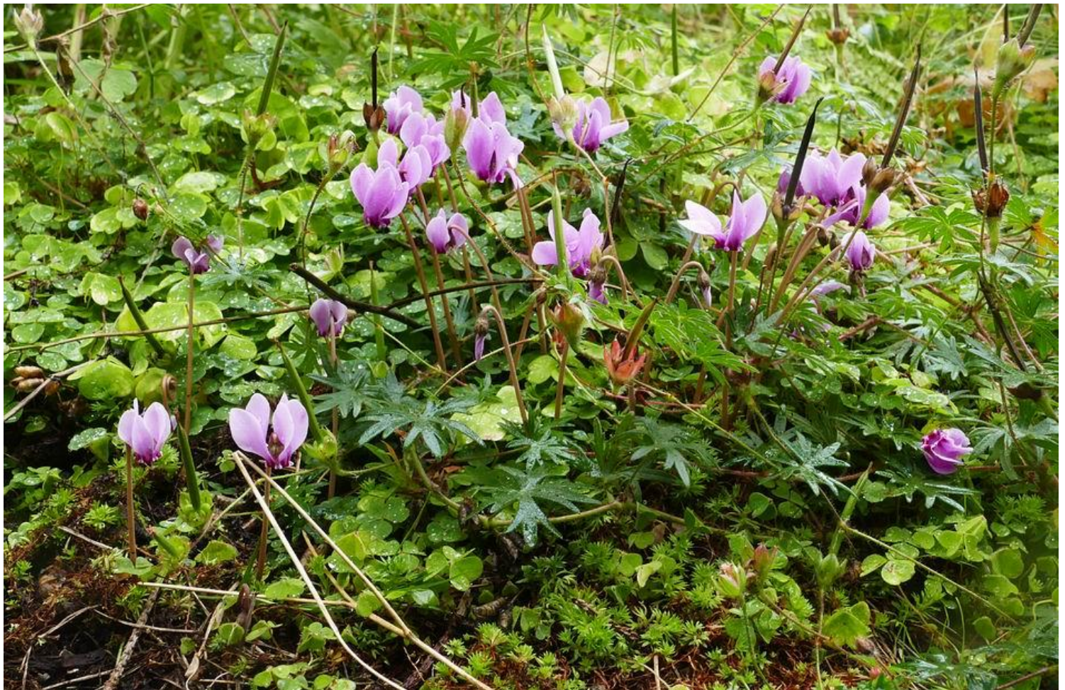
Cyclamen hederifolium growing and flowering in a natural way though Geranium , Galium , Saxifraga and Oxalis .

garden bed. Like with so much of what we grow they were not started by planting out potted plants but by simply scattering seeds. Interestingly this week while I was doing some tidying I found a newly opened Cyclamen hederifolium seed capsule revealing its contents of plump seed. The plant held on to that seed for a year before shedding it at the same time as the new season's flowers were emerging giving us the lead that this is the ideal time to sow any Cyclamen and other bulbous plant seeds you may have.