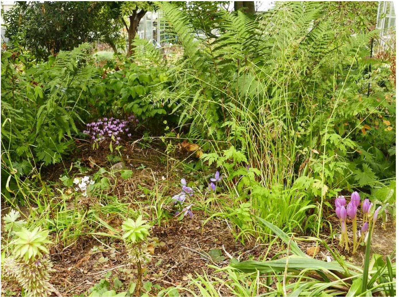
Walking round the garden my eye is drawn to more spots of colour as the autumn flowering bulbs gather a pace.