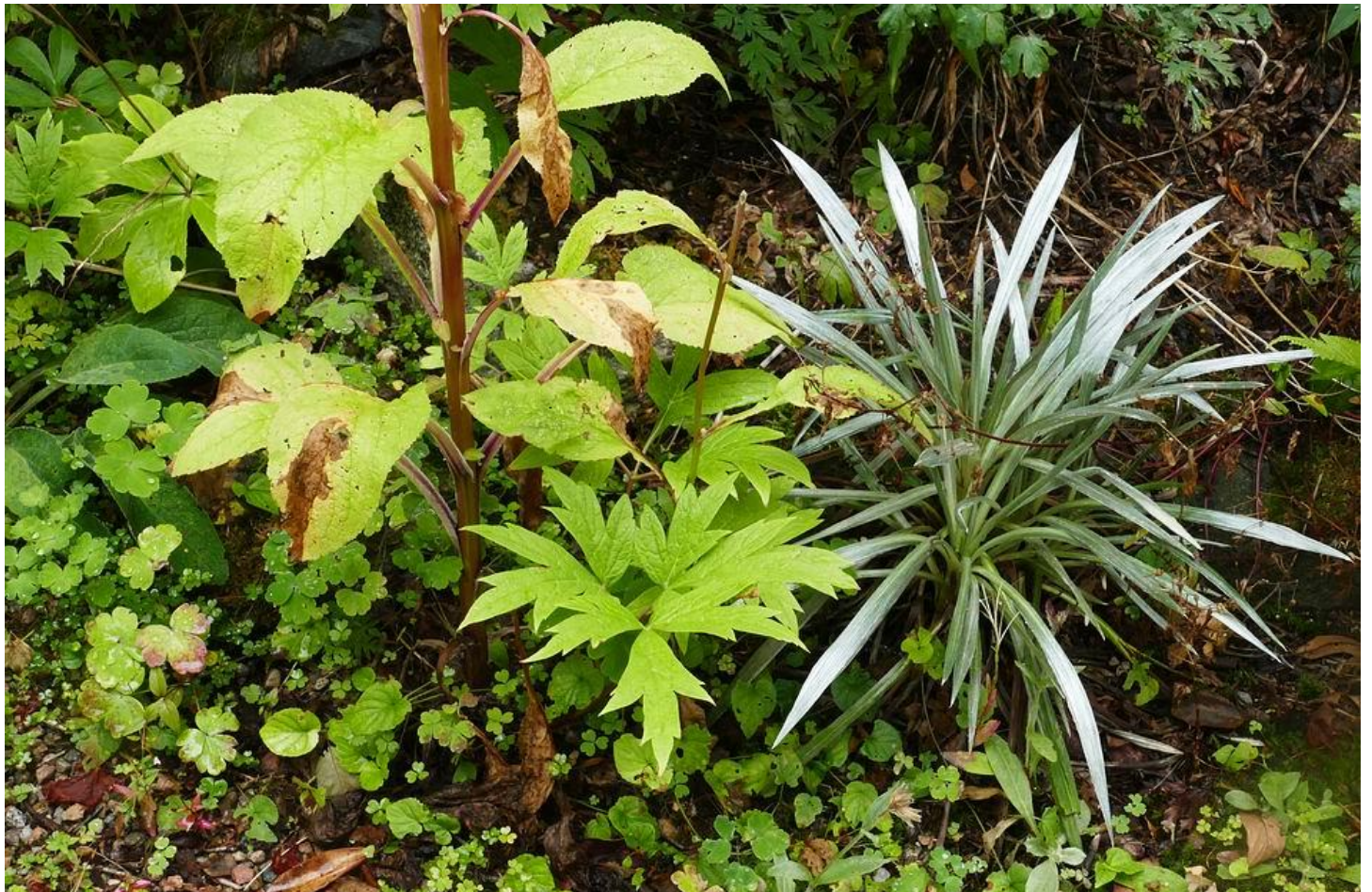
If you grow a wide range of plants in your garden and let them seed around you will always find interest, no matter what the season, here the narrow silver Celmisia lyalli leaves contrast with an array of self-sown plants.