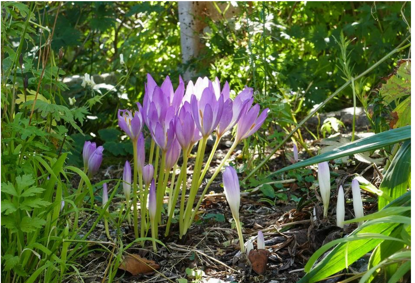
I will leave you for this week with a group of Colchicum partially illuminated by the speckled autumn light.....