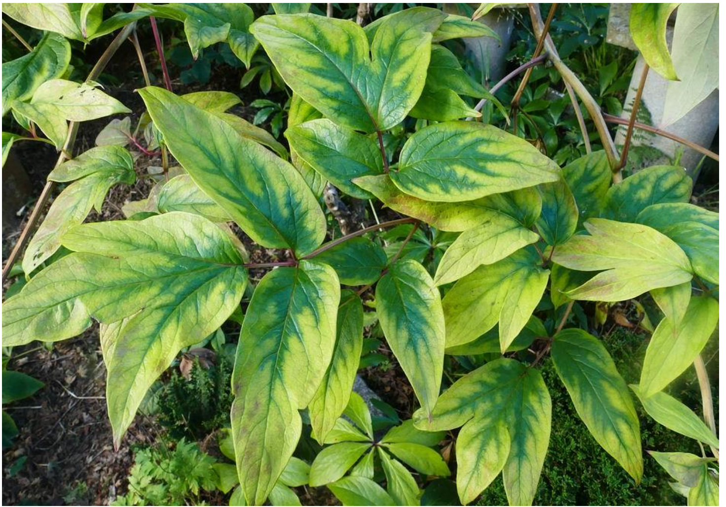
Other leaves are showing their autumn colours such as on this tree Peony.